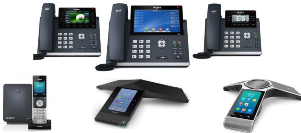
Quality Polycom and Yealink Handsets

For clarity, phone systems are often referred to as a PBX or PABX - which are essentially interchangeable terms. Likewise, Hosted PBX, Cloud PBX, VoIP PBX and Internet PBX mean the same thing ie; a phone system that is hosted in a data centre – as against the traditional phone system with server/s installed onsite.